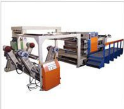
High Speed Cutting Machine

Huitong, the Paper products manufacturing machines supplier is expert in paper production machines, paper producing machine for years in Taiwan. Our paper producing machines include laminating machine, biaxial winding high speed, high speed cutting machine. Huitong always follows the principle of quality-first, customer first and customer-oriented. We have a complete before and after sale service system to make sure all kinds of situation can be solved timely and properly.