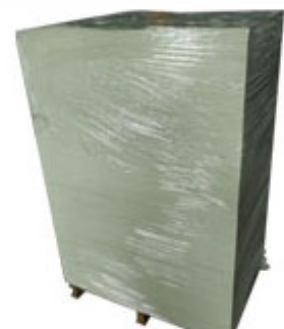
PE Laminated Boards