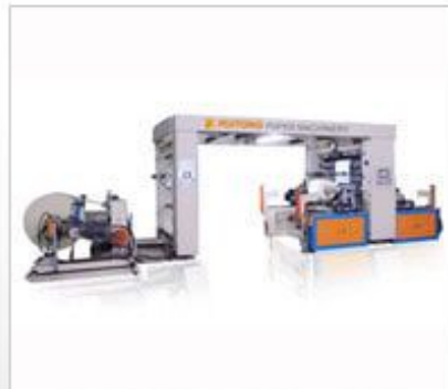
Biaxial Winding High Speed