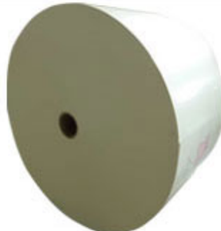
PE Laminated Papers